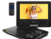
Portable DVD Player