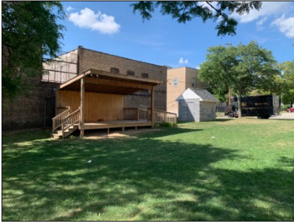
Stage in the Harold Young Parklet